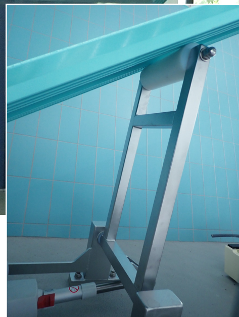
Springboard angle of inclination 0 – 40°