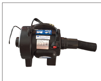
1515010 Electric Hand Pump